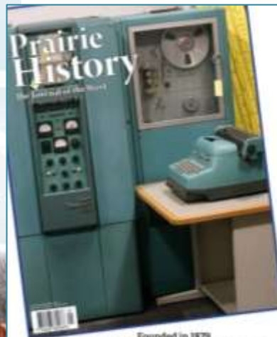
Founded in 1879, the Manitoba Historical Society stands as the second-oldest organization of its kind in Canada

—a testament to generations of Manitobans who believed that understanding our past is essential to shaping our future. From its earliest days, the Society has embraced a broad mandate: to preserve, promote, research, and educate. That mandate continues to guide our work today, offering countless ways for people to explore the province's rich and varied history.